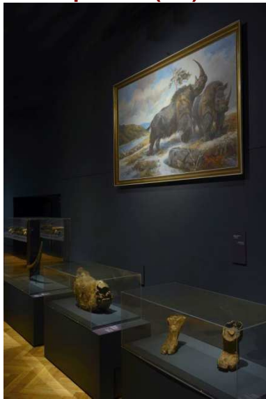
View of the exhibition "Mammoths. Ice Mummies from Siberia."