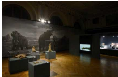
View of the exhibition "Mammoths. Ice Mummies from Siberia."