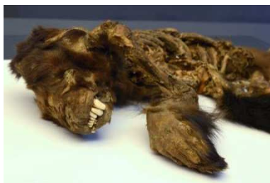
Mummified wolverine ( Gulo gulo )