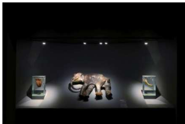
View of the exhibition "Mammoths. Ice Mummies from Siberia." Baby mammoth "Dima", left: his heart, right: his penis