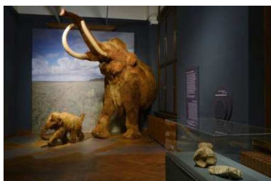
View of the exhibition "Mammoths. Ice Mummies from Siberia."