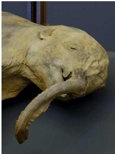
Baby mammoth "Ljuba" (replica)