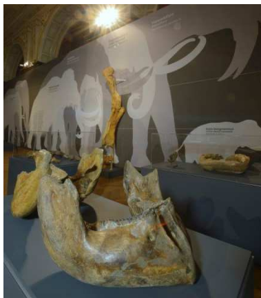
View of the exhibition showing (foreground) the lower section of a mammoth jaw and (background) a chart comparing the sizes of different trunked animals, including the front leg of a Deinotherium