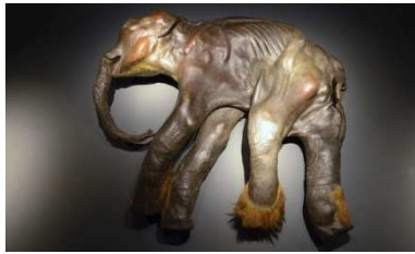
Baby mammoth "Dima"