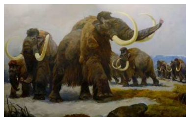
Woolly mammoth ( Mammuthus primigenius ) Painting by Franz Roubal, 1959