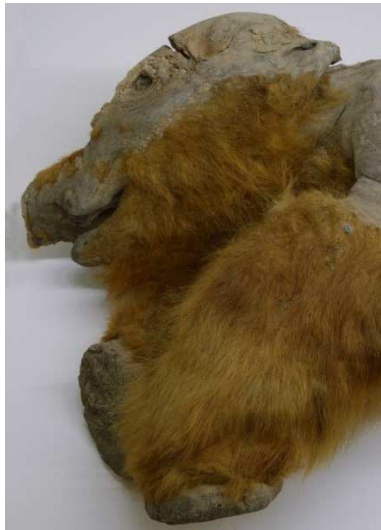
Baby mammoth "Khroma"