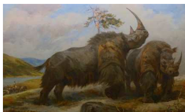
Woolly rhinoceros ( Coelodonta antiquitatis ) Painting by Franz Roubal, 1965