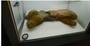
Baby mammoth "Khroma" in his special cooled display case at the NHM Vienna