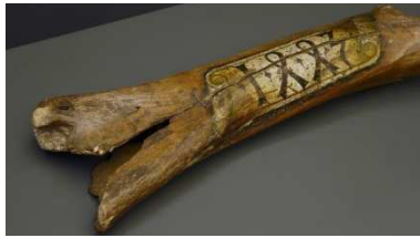
Giant bone from St. Stephen's Cathedral, Vienna "AEIOU" mammoth bone Collections of the Center for Earth Sciences at the University of W Vienna