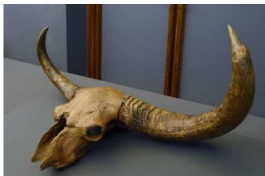
Steppe bison ( Bison priscus ) Skull with horns